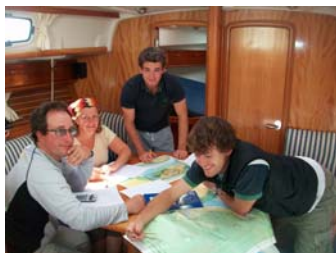
The Day Skipper combined course uses up just 5 days of your annual leave.